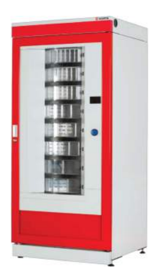
ORSY®mat RT S

You need more information? We will be happy to give you advice