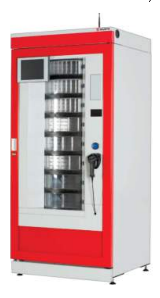
ORSY®mat RT M