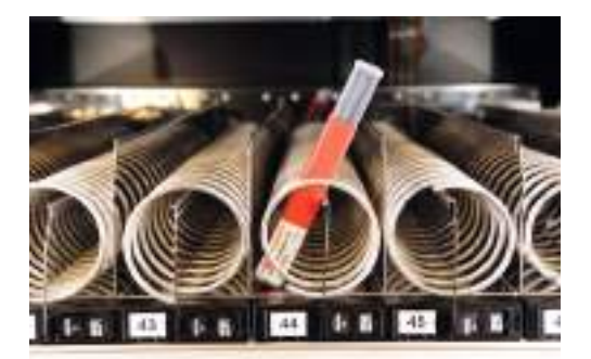
Helix with a half twist