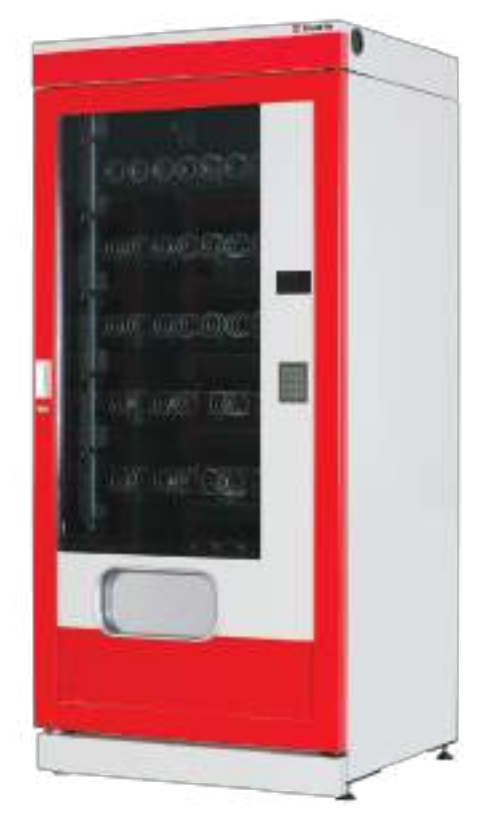
ORSY®mat HX S