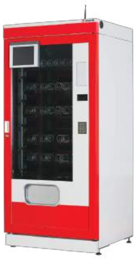
ORSY®mat HX M